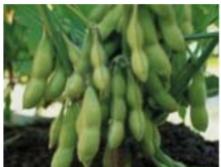
Soybean has become one of the most traded sources of fodder at the global level.

The most commonly used species has been the Melipona beecheii . Unlike the European bee ( Apis mellifera ), the Mayan one does not have a stinger, its honey is darker and Mayans from the Yucatan Peninsula have used it for centuries in a variety of ways: as a sweetener for hot drinks, as the base for alcoholic drinks, and for its medical attributes. The Mayan (dark) bee-wax has also been a traditional resource: for religious rituals related to the agricultural harvest, for religious offerings, ceremonies (as in candles) and decorations, for sculptures (representing humans, animals, and gods), and as a highly valuable monetary unit of trade.