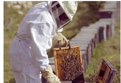
In Mexico, apiculture involves 42 thousand beekeepers.

This GM soybean was introduced to Mexico in 1998, and is now grown in 9 federal states. In 2011, the Mexican federal government reported 167,889 ha of soybean plantations (14,959 ha in the YP), which produced 141,143 tons (25,786 tons in the YP) sold to the