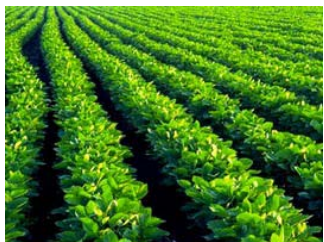
Soybean plantations are homogeneous agroecosystems.