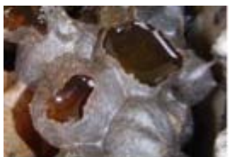
Meliponan honey as in the beehive