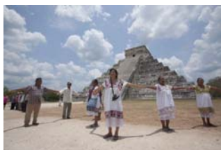
MA OGM' demonstration in Chichen Itza, Yucatan.