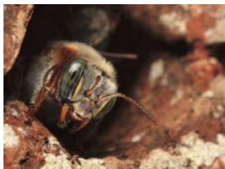
Melipona beecheii (Mayan bee)