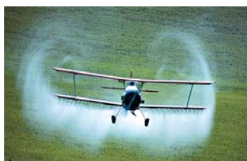
Air dispersion of Glyphosate