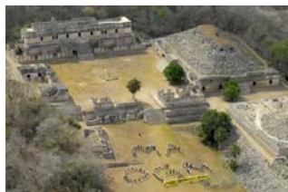
Demonstration in Oxkintoc, Yucatan. MA means 'no' in Mayan, OGM are the initials in Spanish for GMO.