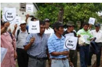
Beekeepers from Quintana Roo protest against GMOs plantation in the region.