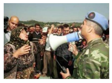
Protest against gold mining in Turkey

The health and environmental damages of fossil fuel exploitation (e.g., oil spills), nuclear waste and radiation, and mining-related pollution represent some of the most well-known effects of the increasing energy and material use of the global economy.