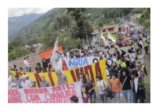
In Cajamarca, Tolima, 1,300 march against large-scale mining

The exploration phase at La Colosa revealed the presence of a gold vein system at a grade of 0.3 grams/tonne stretching 1,500 metres (4,921 feet). The inferred reserves are 381.4 million tons with an average of 1.00 grams/tonne (or