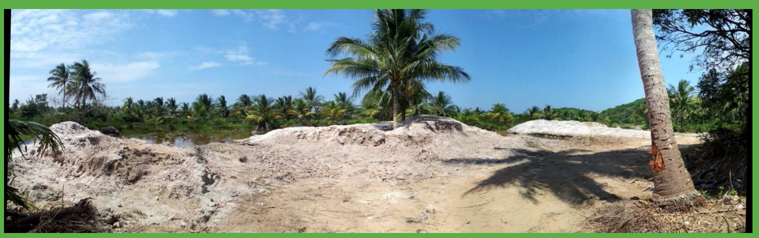
Sand extraction for building local infrastructure.