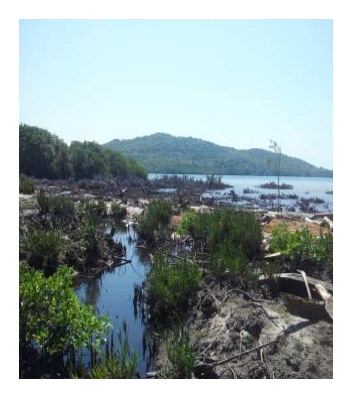
Figure 3: Mangrove cutting for local building material.