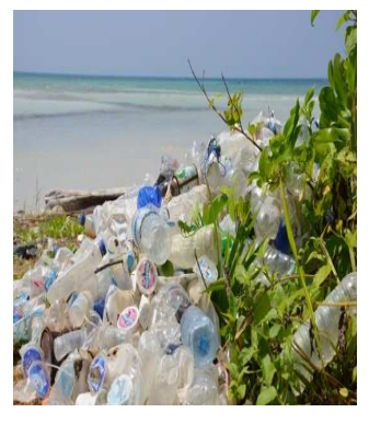
Figure 4: Waste.