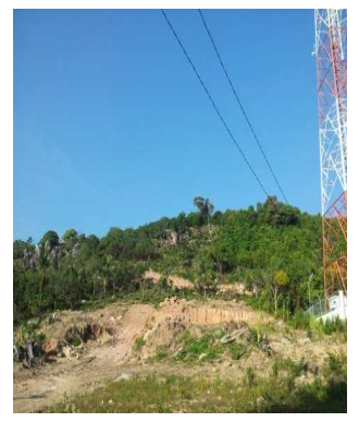
Figure 2: Clear-cut and sand extraction - a failed tourism project.