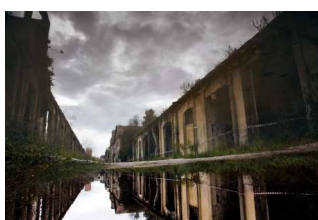
Figure 3: Former SNIA complex https://lagoexsnia.wordpress.com/gallery/