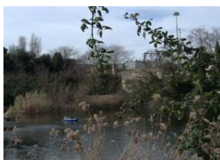
Figure 4: The lake https://lagoexsnia.wordpress.com/gallery/