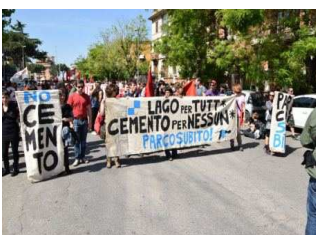
Figure 5: Citizen march for public park and lake

Championship of 2009 would be built in the area around the lake. These rumours led to protests by early 2009, by residents who had pushed for years for the incorporation of the park and the lake, as a public park.