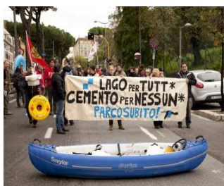
Figure 2: Citizen march for the lake https://lagoexsnia.wordpress.com/gallery/